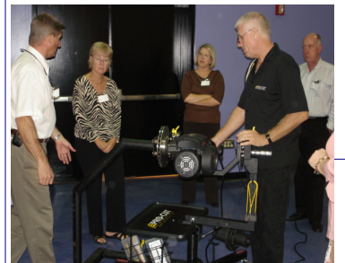
Pro-Cut performing a live demo.